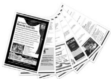
Exhibit Catalog Advertisement Mentor Discount

“Mentors” receive a substantial discount on Exhibit Catalog Advertisements.